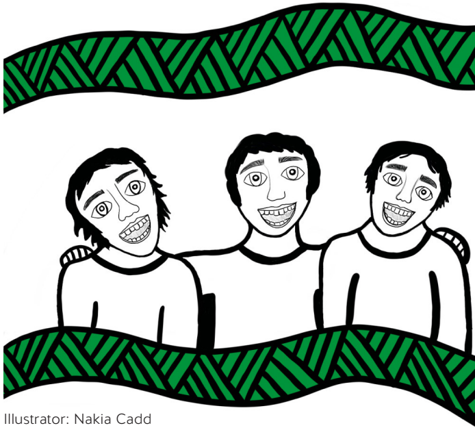
Illustrator: Nakia Cadd

Call Gambler's Help on 1800 858 858 any day, any time.